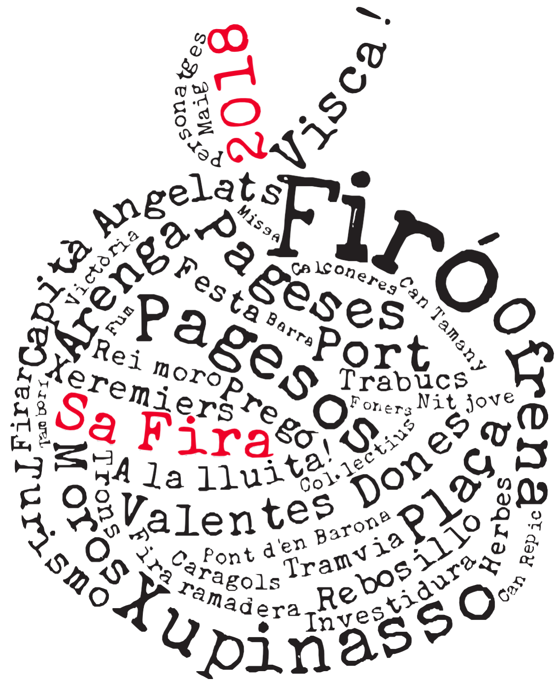
Portada guanyadora de Estefanía Salomón