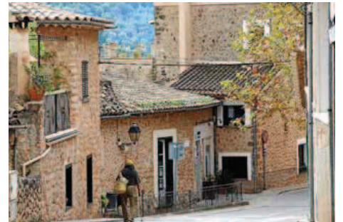
Fornalutx is a municipality with a spectacular architectural heritage.

Representatives from Fornalutx went to the Fitur international tourism fair, where recognition of inclusion on the list of prettiest villages was made, and to coincide with this a promotional video was presented. This tells the story of For-