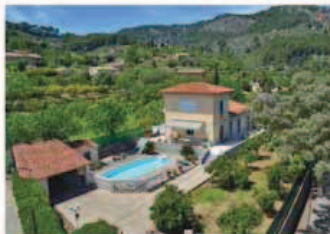
Beautiful small villa with pool in a quiet location in the outskirts of Sóller — Ref: SO1271. 850.000 €

On tourism promotion, two brochures in four languages for visits to the parish and Sant Miquel churches have been very well received.