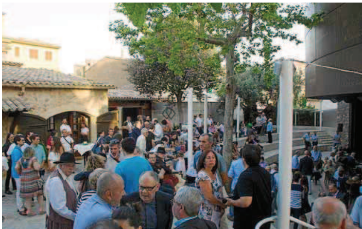
The Visit Valldemossa project was presented at Costa Nord. It is one to highlight the tourist, cultural and heritage potential of Valldemossa.

Other projects that the town hall has undertaken