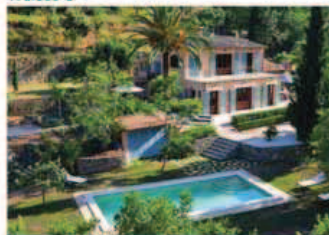
Idyllic finca with breathtaking mountain views and large pool — Ref: SO1885. 1.800.000 €