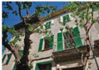
Very nicely renovated apartment with terrace in Sóller — Ref: SO2713. 215.000 €