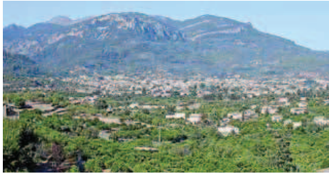
General view of the Soller Valley with the Tramuntana in the background.

These are routes for all types of walker, including the family group, which are being promoted via tourist