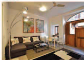
Nicely renovated apartment in the centre of Fornalutx — Ref: FO2411. 175.000 €