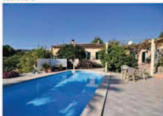
Chalet with guest cottages, garage and pool in Sóller — Ref: SO1233. 735.000 €