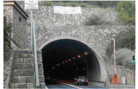
General view of the entrance to Soller's tunnel.

Above all, it is in order that it should be conserved and preserved as we know it. Let us not forget that it has acquired this status because of its values, and these must be protected. The landscape has to be improved but it