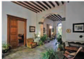
Large modernistic townhouse with garden in the centre of Sóller — Ref: SO1542. 480.000 €