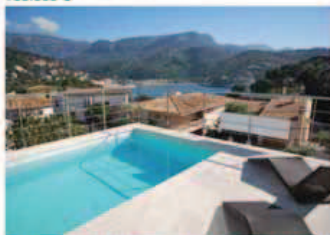
Sunny new built villa with pool and garage in Port de Sóller — Ref: PS1582. 1.450.000 €