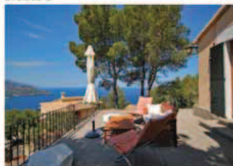
House with incredible views to the coast of Deià Ref: SO1434. 850.000 €