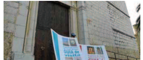
The town hall has published guides to the churches in four languages.

On tourism promotion, two brochures in four languages for visits to the parish and Sant Miquel churches have been very well received.