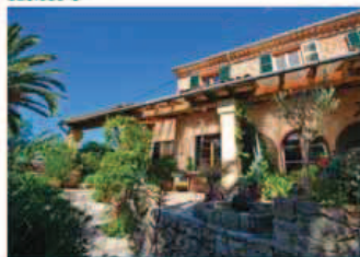
Beautiful traditional Finca in best location in the outskirts of Sóller — Ref: SO1767. 1.650.000 €