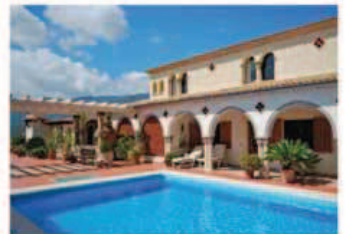
Apartment with community pool in privileged location in Port de Sóller — Ref: PS2622. 295.000 €