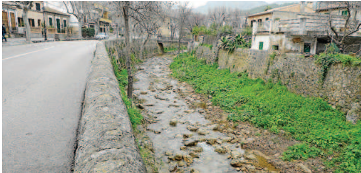
The torrent was able to cope with the recent heavy rain because of cleaning work.