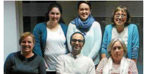
The administration is prioritising environmental aspects.

The town hall's website has been modified in order that it can include the project for participative budgets, one in which residents can take part in deciding the use of 50,000 euros allocated to this form of citizen participation.